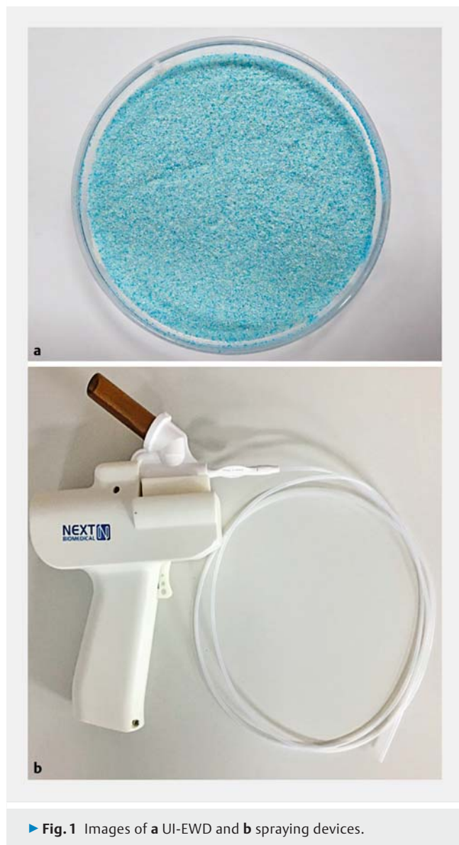
► Fig. 1 Images of a UI-EWD and b spraying devices.

clogging of the delivery catheter and impaired visualization due to formation of powder-in-air suspensions.